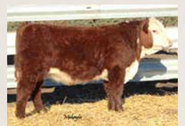
Maternal Brother to 946G: 837F