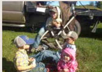
Preg-checking crew on snack break.