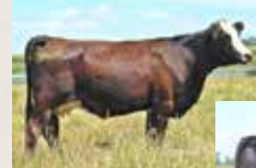
Dam of 026H: 717E