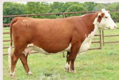
Dam of 043H: 148A