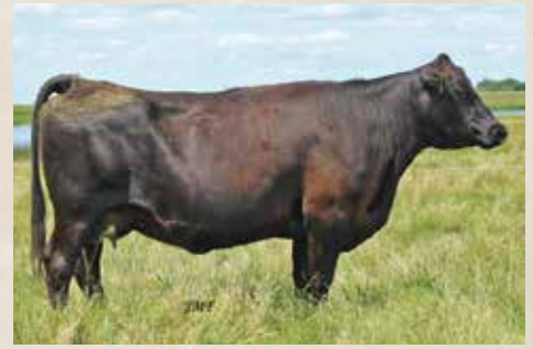
Dam of 039H and Grandam of 035H: 505C