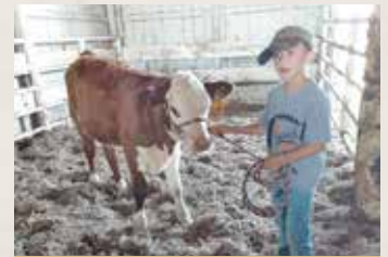
The kids enjoyed halter breaking a few heifers.