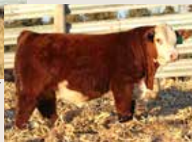
Maternal Brother to 029H: 719E