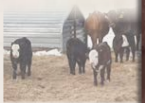
Fall born baldy babies from a 2-year-old Cowman bull sold on our 2020 sale.