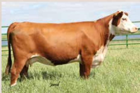
Dam of 011H: 1224