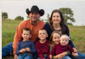
The JMF Family.