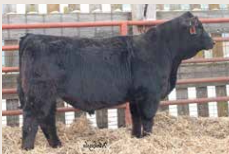
Maternal Brother to 042H: 952G