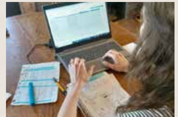
Putting in the numbers.