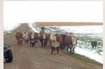
Moving cows home for the year.