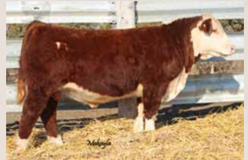
Maternal Brother to 009H: 802F