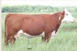
Maternal Sister to 053H: 121A