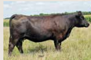
Dam of 035H: 819F