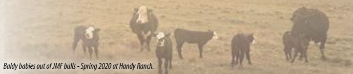
Baldy babies out of JMF bulls - Spring 2020 at Handy Ranch.

United x Wide Range ASA 3813264 • BW: 60 • Adj. 205: 842