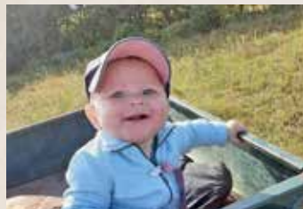
Smiley girl checking cows with Dad.