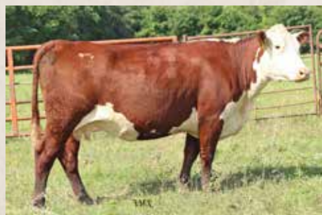
Dam of 046H: 623D