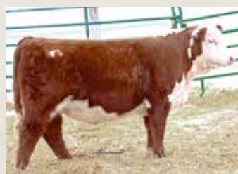
Maternal Brother to 946G: 410B