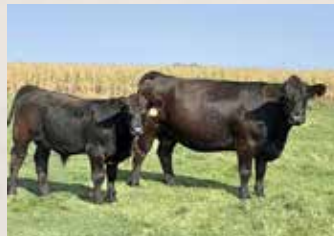
308A and 042H out on summer pasture.