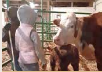
Meeting a new momma and baby.