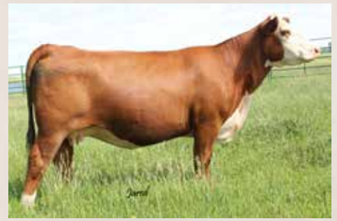
Dam of 009H: 1319