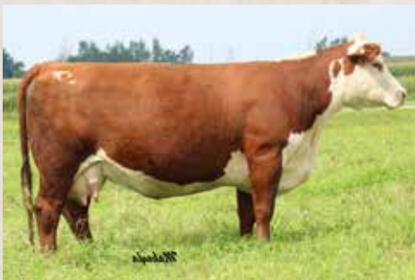
Dam of 038H: 44X