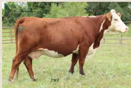
Dam of 027H: 406B