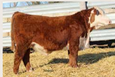
Maternal Brother to 043H: 817F