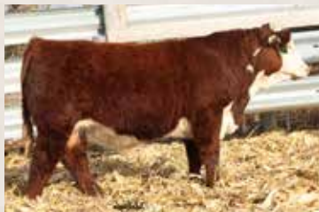
Maternal Brother to 041H: 714E