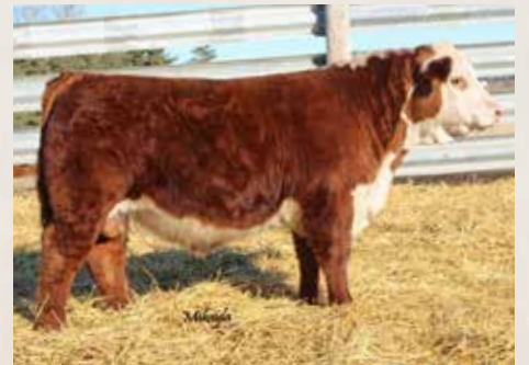
Maternal Brother to 733E: 834F