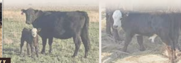
Baldy babies out of JMF bulls - Spring 2020 at Handy Ranch.