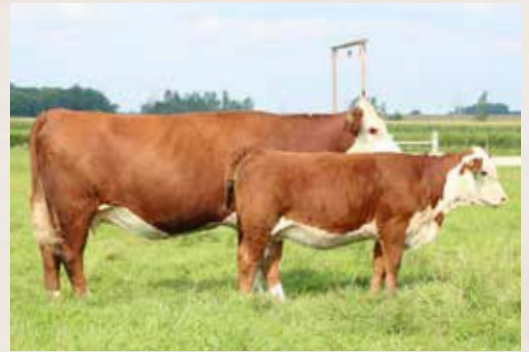
Grandam (1210) to 031H, and dam (713E) pictured as a heifer calf. 1210 is also the dam to bull 003H.