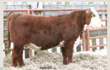
Full Brother to 003H: 911G