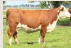
Dam of 034H: 713B