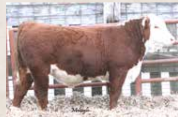
Maternal Brother to 041H: 938G