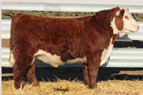
Maternal Brother to 011H: 820F