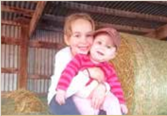
The girls on nice fall day.