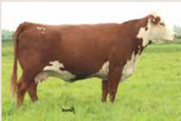
Great Grandam of 016H and 020H: 31U