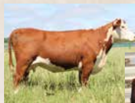
Grandam of 023H and 027H: 66Z