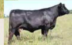
Grandam of 026H: 412B