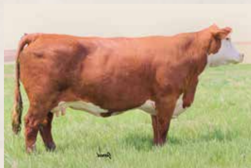
Grandam of 029H: 0953