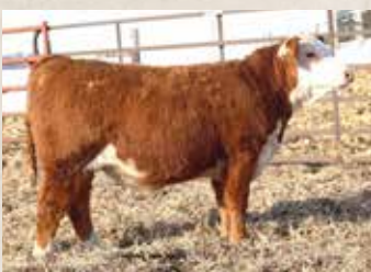
Paternal Brother to 946G: 949G