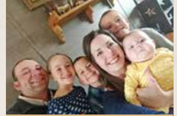
Mother's Day spending time together.