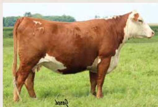
Grandam of 022H: 148A