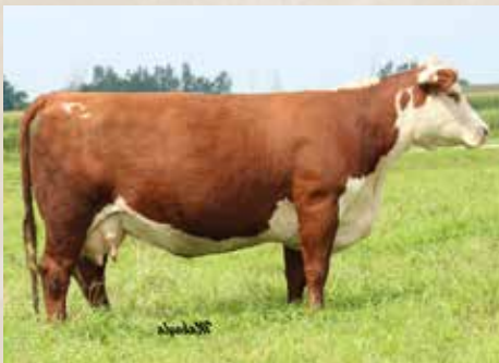
Dam of 733E and Maternal Sister to 946G: 44X