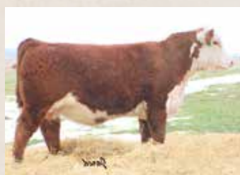
Maternal Brother to 946G: 609D