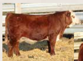
Maternal Brother to 029H: 823F