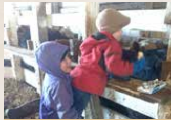
Too short to mark cows? Nah...