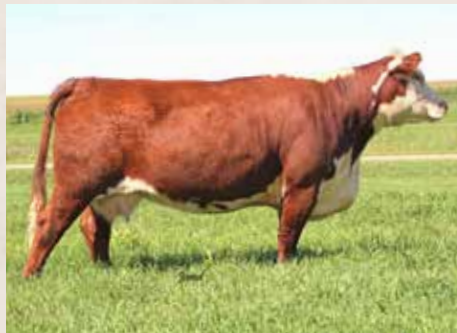
Grandam of 733E and Dam of 946G: 94T