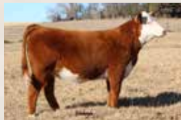
Dam of 056H as a heifer calf: 735E