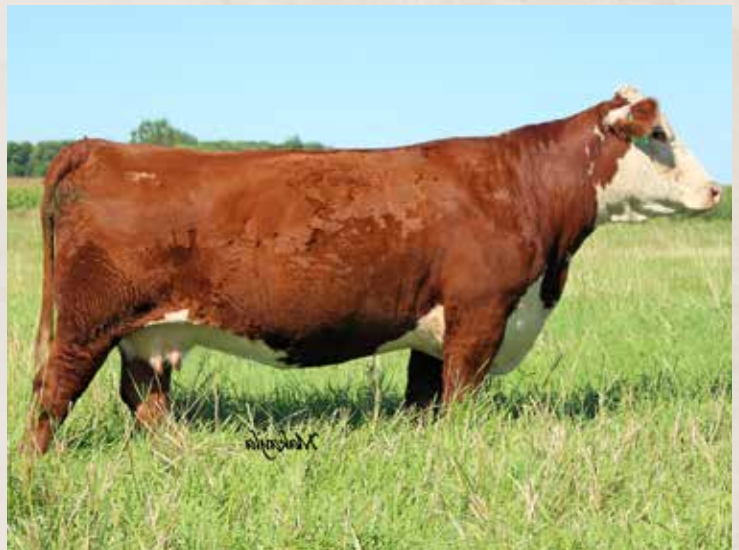
Dam of 041H: 518C