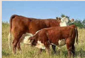
152A and 043H on summer pasture.