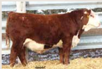
Maternal Brother to 041H: 836F