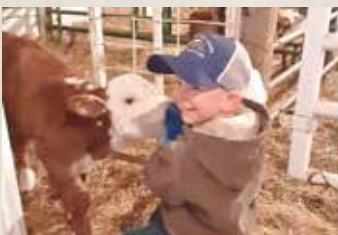
The kids enjoyed bottle feeding a few calves.