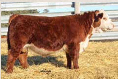
Maternal Brother to 038H: 834F