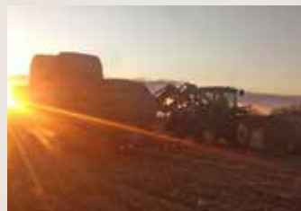
Hauling comstalks home.