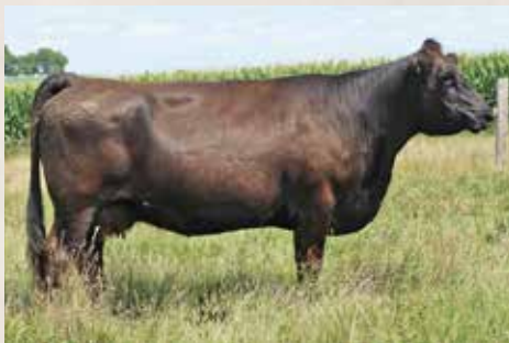
Dam of 042H: 308A