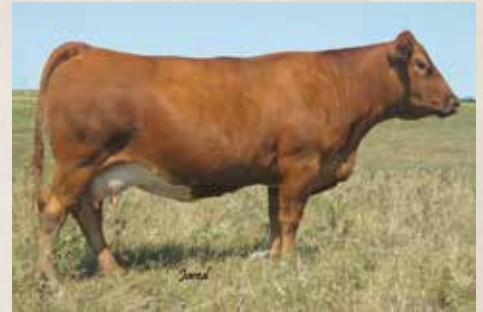
Grandam of 039H and Great Grandam of 035H: S6030