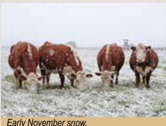
Early November snow.