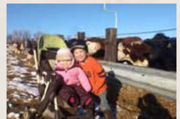
Enjoying a beautiful November day.

...it's our family's heritage and future.