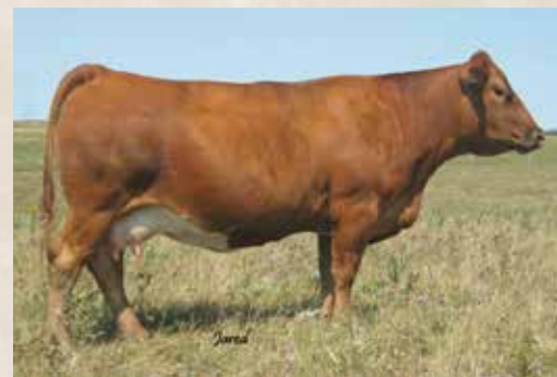
Great Grandam of 010H: S6030

find out more about our Simmental program: WWW.JMFHEREFORDS.COM