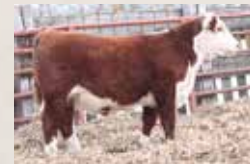
Maternal Brother to 034H: 929H