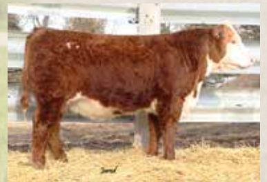
Maternal Brother to 003H: 832F