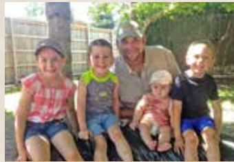
We enjoyed a summer trip to the zoo.