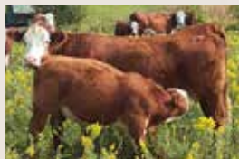
058H and his Dam, 833F in mid-Sept.