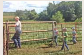
Dad. Dad! Why? Hey Dad! Dad...