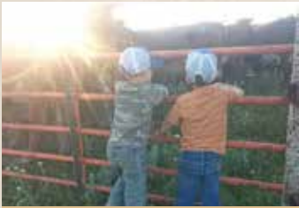
If only we knew what they really think!