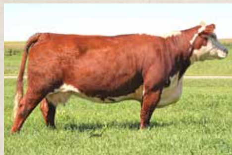
Grandam of 046H: 94T