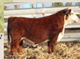
Maternal Brother to 027H: 718E